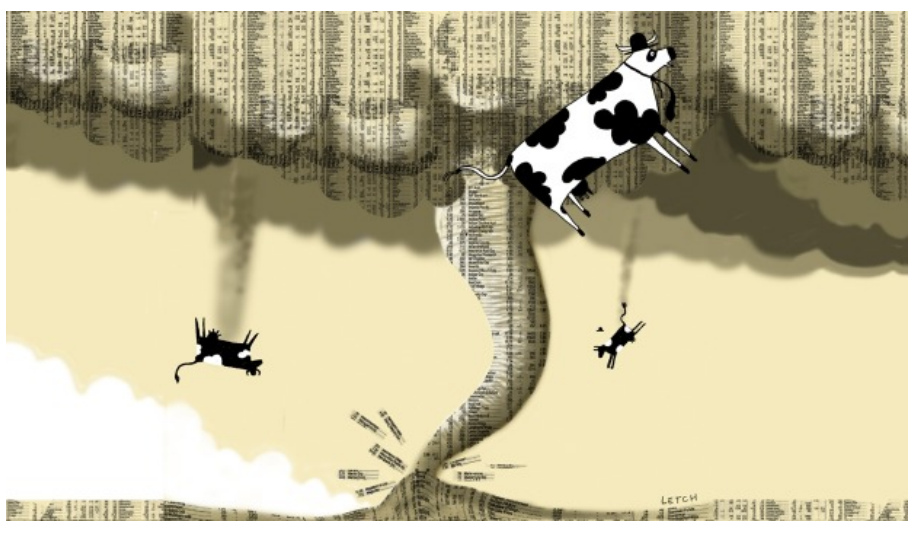
You can, of course, always fall back on the less elegant explanation that passive strategies suit because you have neither the time nor the wit to pit yourself day in, day out against the collective might of the great unwashed. Simon Letch